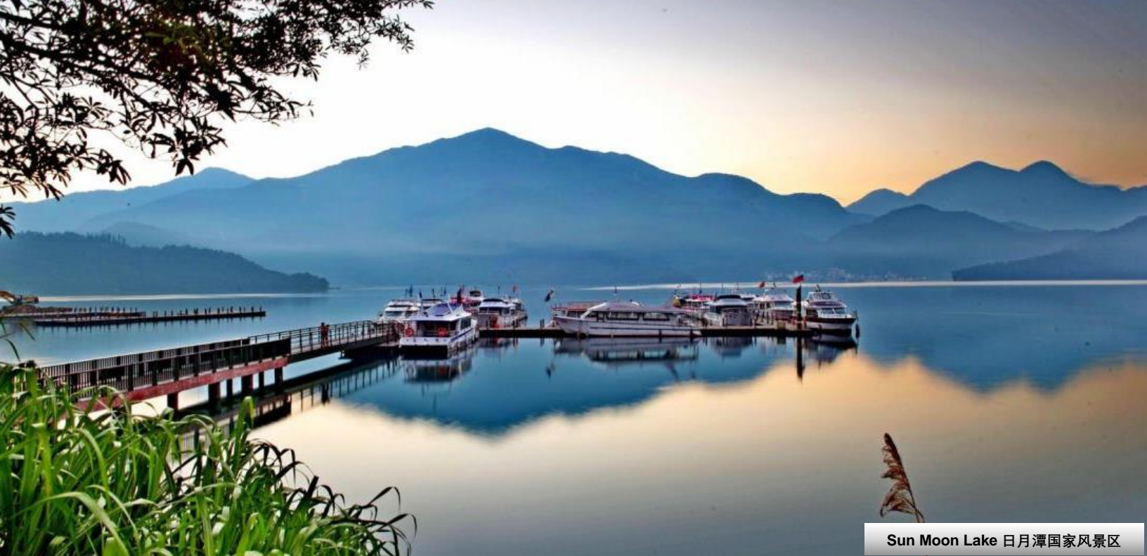
Sun Moon Lake 日月潭国家风景区