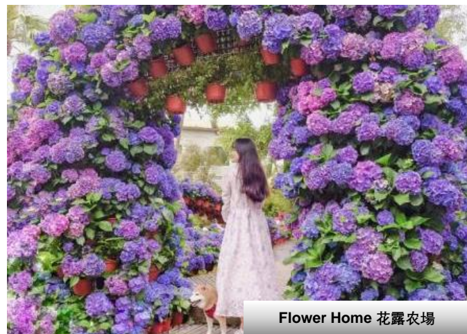
Flower Home 花露农场