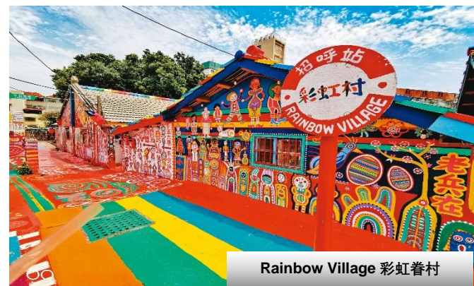
Rainbow Village 彩虹眷村