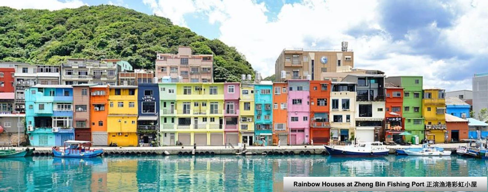
Rainbow Houses at Zheng Bin Fishing Port 正滨渔港彩虹小屋