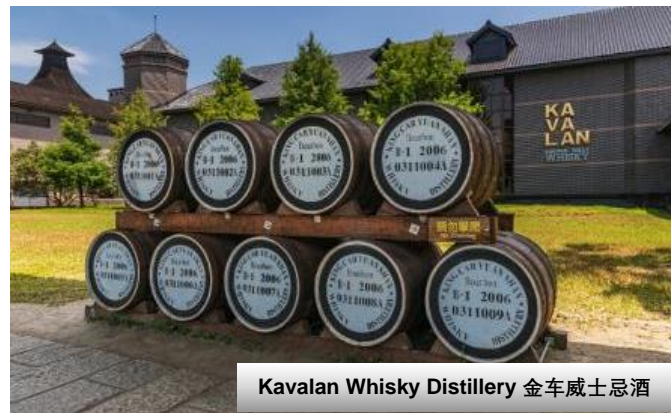
Kavalan Whisky Distillery 金车威士忌酒