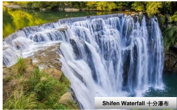
Shifen Waterfall 十分瀑布