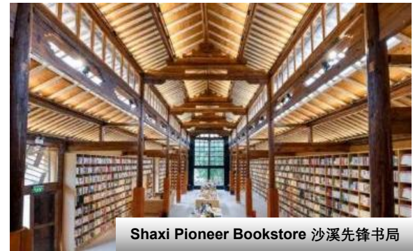
Shaxi Pioneer Bookstore 沙溪先锋书局