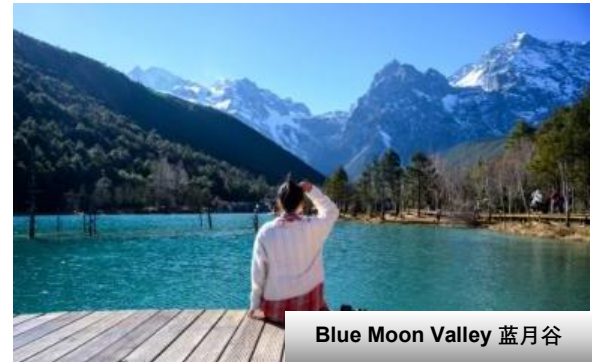
Blue Moon Valley 蓝月谷