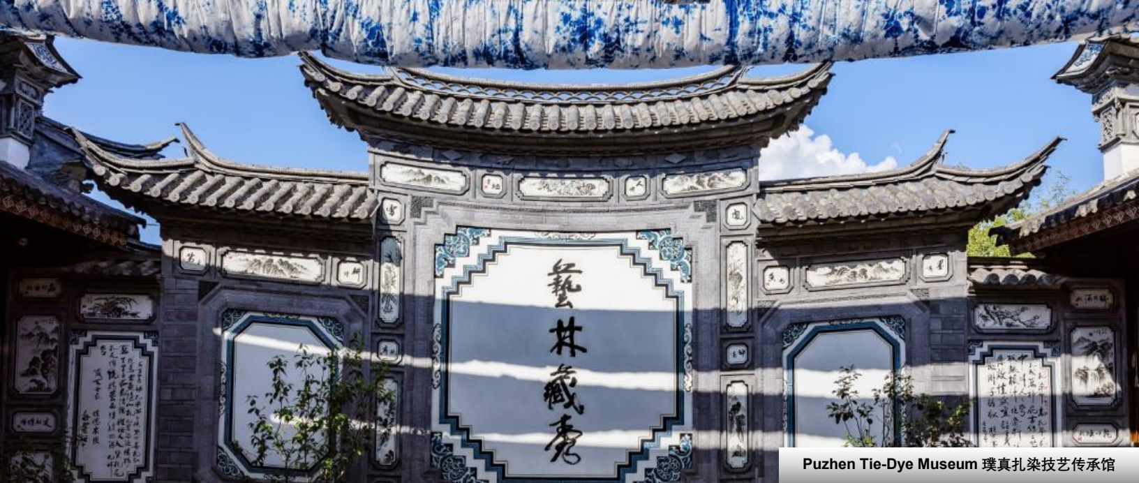
Puzhen Tie-Dye Museum 璞真扎染技艺传承馆