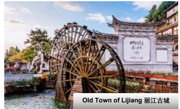
Old Town of Lijiang 丽江古城