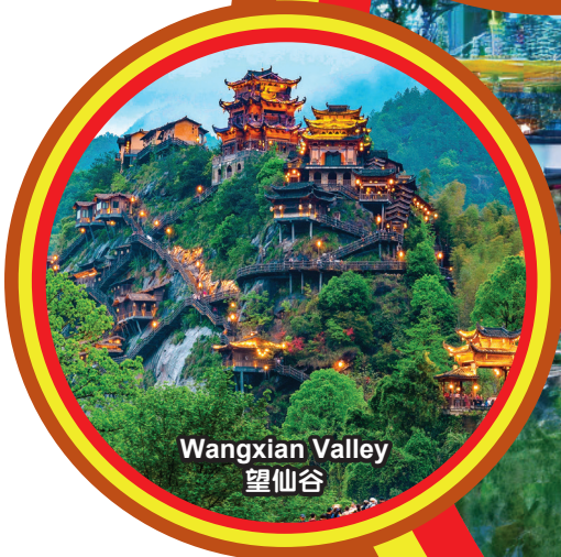
Wangxian Valley 望仙谷