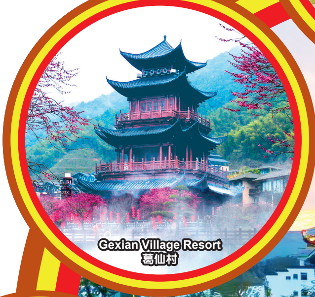
Gexian Village Resort 葛仙村