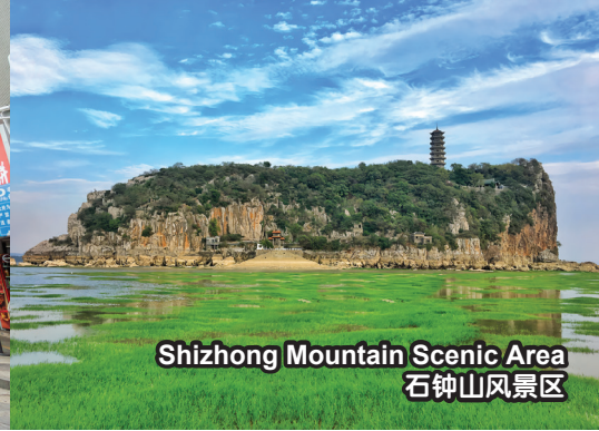
Shizhong Mountain Scenic Area 石钟山风景区