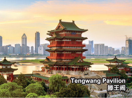
Tengwang Pavilion 滕王阁