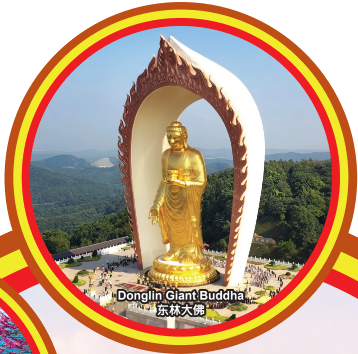
Donglin Giant Buddha 东林大佛