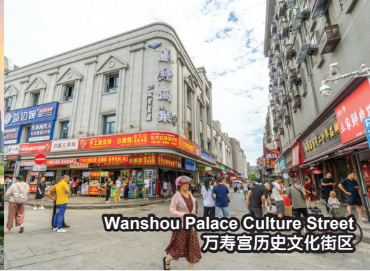
Wanshou Palace Culture Street 万寿宫历史文化街区